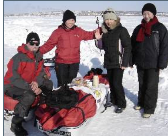
Welcome party Chersky

The welcome party started already 2 km:s before we reached the settlement. It consisted of 3 interesting and friendly ladies on skis belonging to the only organization of its kind in Yakutia - the prevention of domestic violence. They made us feel very welcome by serving us plenty of local delicacies -yes, since many readers have pointed this fact out, we can't deny it anymore, we have gained additional weight since leaving Kolymaskaya- and niceties, before we all together made our way into Chersky. They didn't take no for an answer either, so they pulled our pulks and didn't therefore arrive as relaxed as we did, but very sweaty and tired. Once there, a group of elderly gents in fur hats turned up, belonging to the organisation for the preservation of the nature and they made the ladies feel un-welcome. They were the official welcome party, and, to honor this specific occasion, they were all slightly intoxicated.