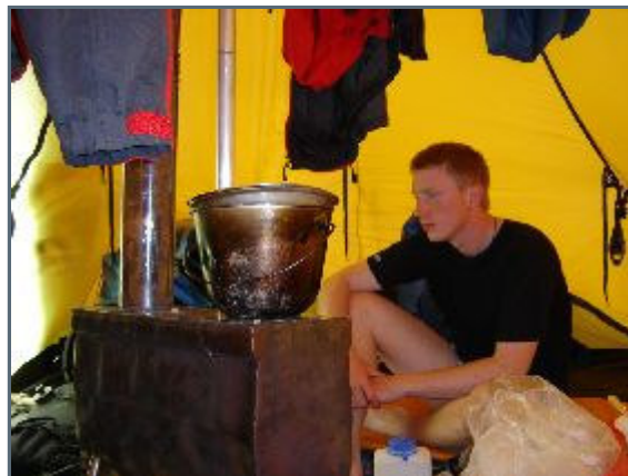
Soaked camp Kulu river

Immediately after sending last nights dispatch, we realized the waterlevel in the river had risen enormously and that we would be forced to abandon camp once again same day! Traveling during the night is impossible, so we put the alarm on 15 minutes throughout the night to check the level of the river. We were forced to brake camp at 4.30 am. The river is full of sediment and is dangerously fast. If we turn over, thats it. The area is totally flooded and it is almost impossible to find anywere to pitch camp. We found this camp at 11 am, after 12 kms paddling. If speed picks up even more on the river, we're stuck. Unable to move. It rains continuously and the mosquitos are swarming us.