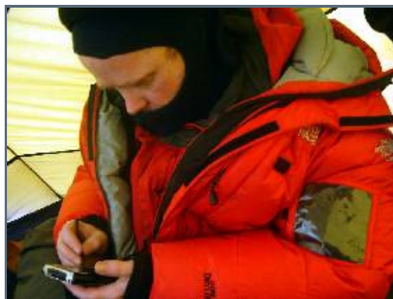
Writing today's report

After 1 hour of skiing today, we did a spectacular move for the first time since we started skiing from Zyryanka in November, we took the gloves off, and the Gore-Tex Jacket and skied only in our thermal underwear! What a tremendous feeling! Birds were singing and the sun was shining and I thought: