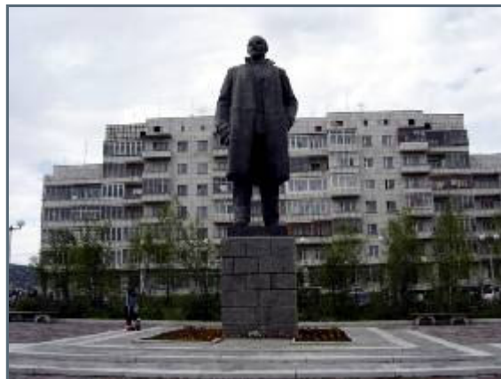
A left over from the Sovjet time

One can only fly into Magadan. There's no railway and no road leading here. There is a harbour, though, the same one that Stalin used to ship millions of unfortunate campinmates to the deadly Gulags, which of the worst renowned was situated just outside Magadan. It seems the town is a leftover from the time before perestrojka. The red star and other sovjet signs are easily spotted all over town and Magadan seems badly run down. Times are known to be extremely hard. The unemployment is disastrous, the opportunities for decent future for somebody young are bleak and the infrastructure is on the verge of collapsing. This is what people in Moscow told us.